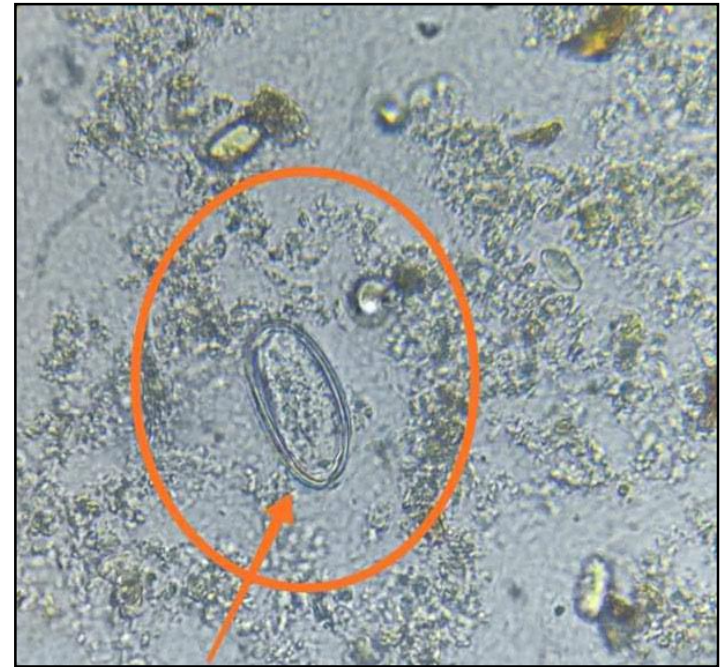
Image 1: A direct stool smear showing distinct planar convex eggs of E. vermicularis

Patients with pinworm disease have much lower levels of the divalent metal transporter protein DMT1. Because it plays an essential role in the transport and absorption of iron across the cell membrane (Montalbetti, et al. , 2013), it has been shown that there is a significant inhibition in the gene and protein expression of DMT1 during infection with some types of intestinal parasites (Roellig, et al. , 2015).